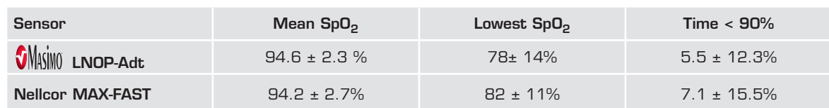
Group 2. Data from 12 patients with no artifact displayed